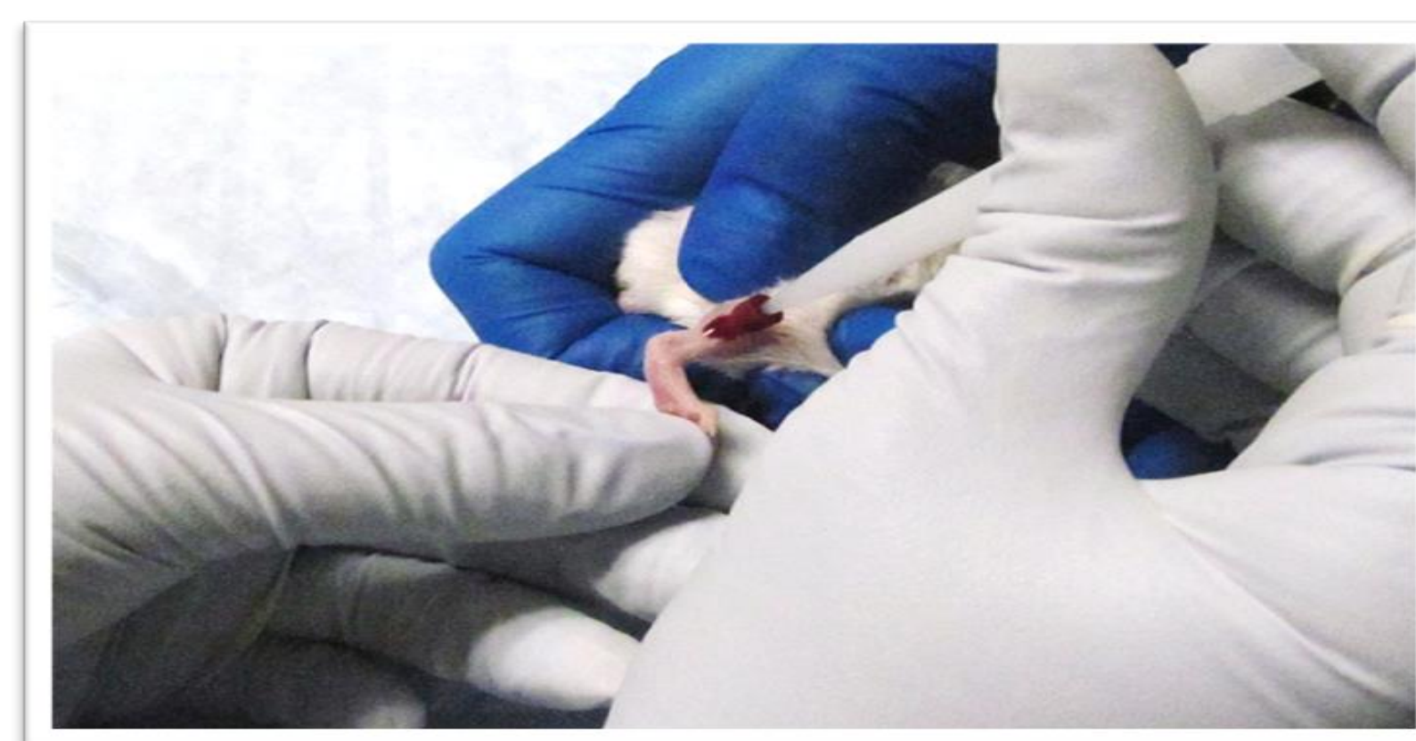
Figure 2. Sample collection

The Mitra® microsampling kit includes the following: